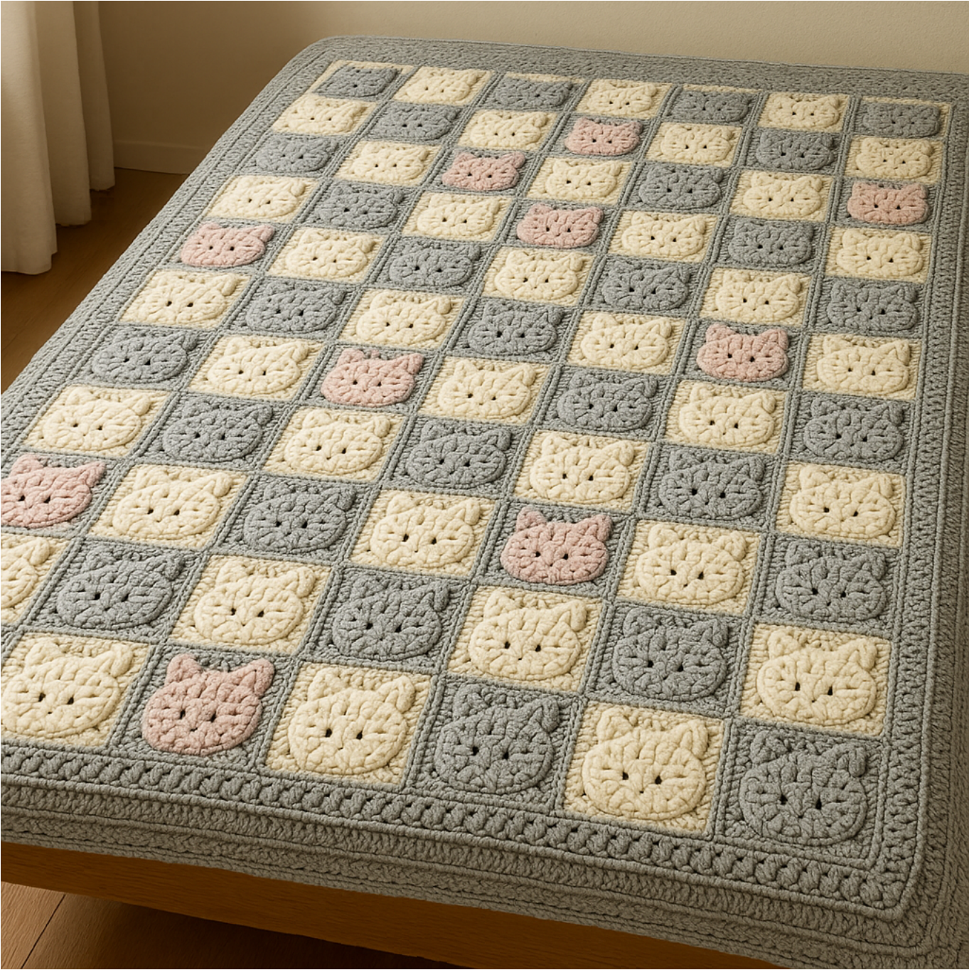
Finished Blanket Example